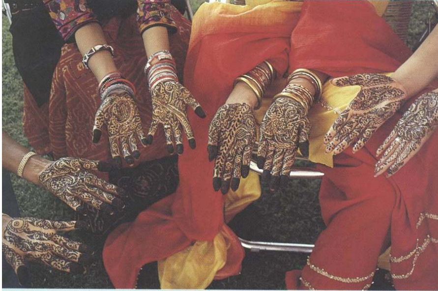
A World of Communities