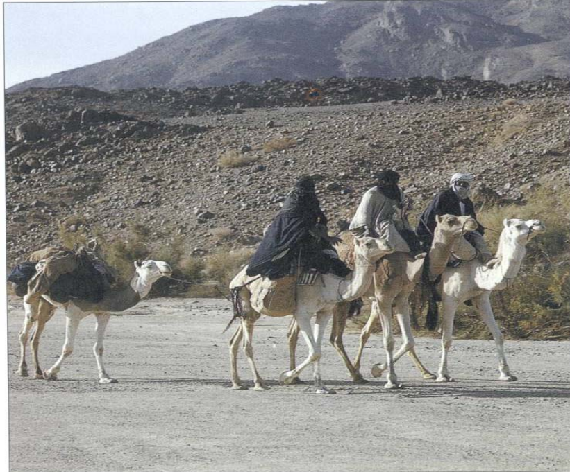
Bedouins riding camels