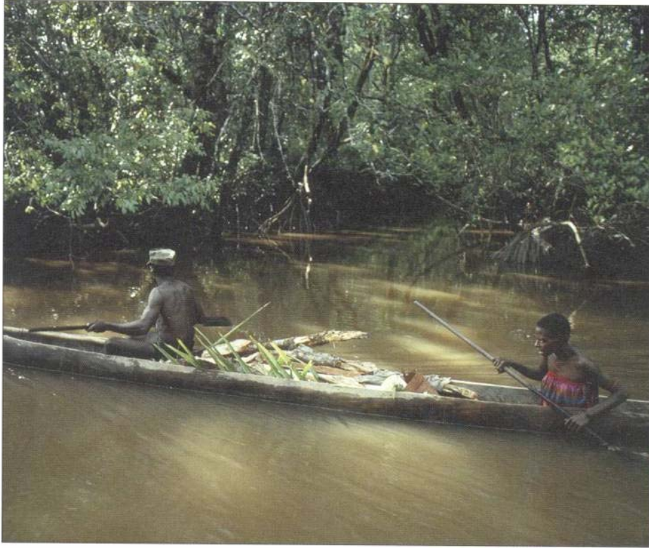
Traveling by canoe